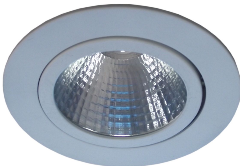
Softlight Tilt without glare control