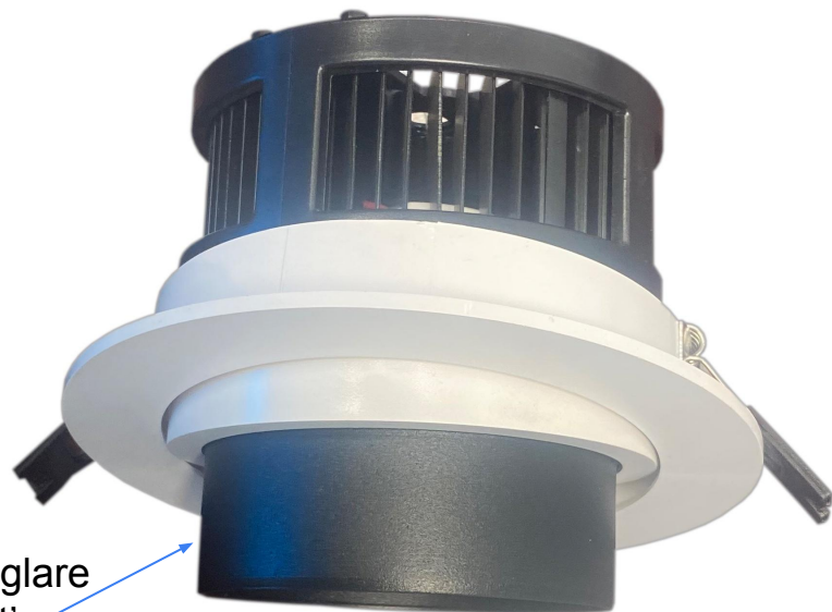
Softlight Tilt with glare control 'snoot'